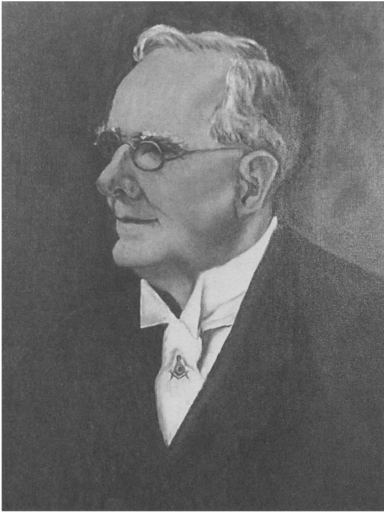
Governor Sidney Johnston Catts (1917-1921) helped to perpetuate and intensify the nativist and racist atmosphere in Florida during the 1910s and 1920s.

his successor Sidney Catts (1917-1921) initially ignored it. Trammell, who had been the state's attorney general prior to becoming governor, was no friend of black Floridians. During his attorney generalship, he had disregarded the lynching of twenty-nine blacks and did the same when another twenty-one were lynched during